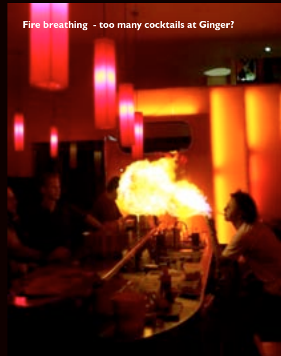
Fire breathing - too many cocktails at Ginger?